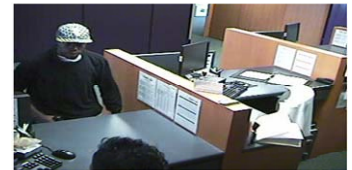
Capture Size: 352 x 240 pixels Recorder Network Name: DVRGS0751A907 Recorder Serial Number: GS0751A907 Recorder Station ID: 2186

This picture represents an actual robbery that occurred in the City of Colonial Heights. (Note: The quality of camera & positioning was instrumental in identifying the suspect.